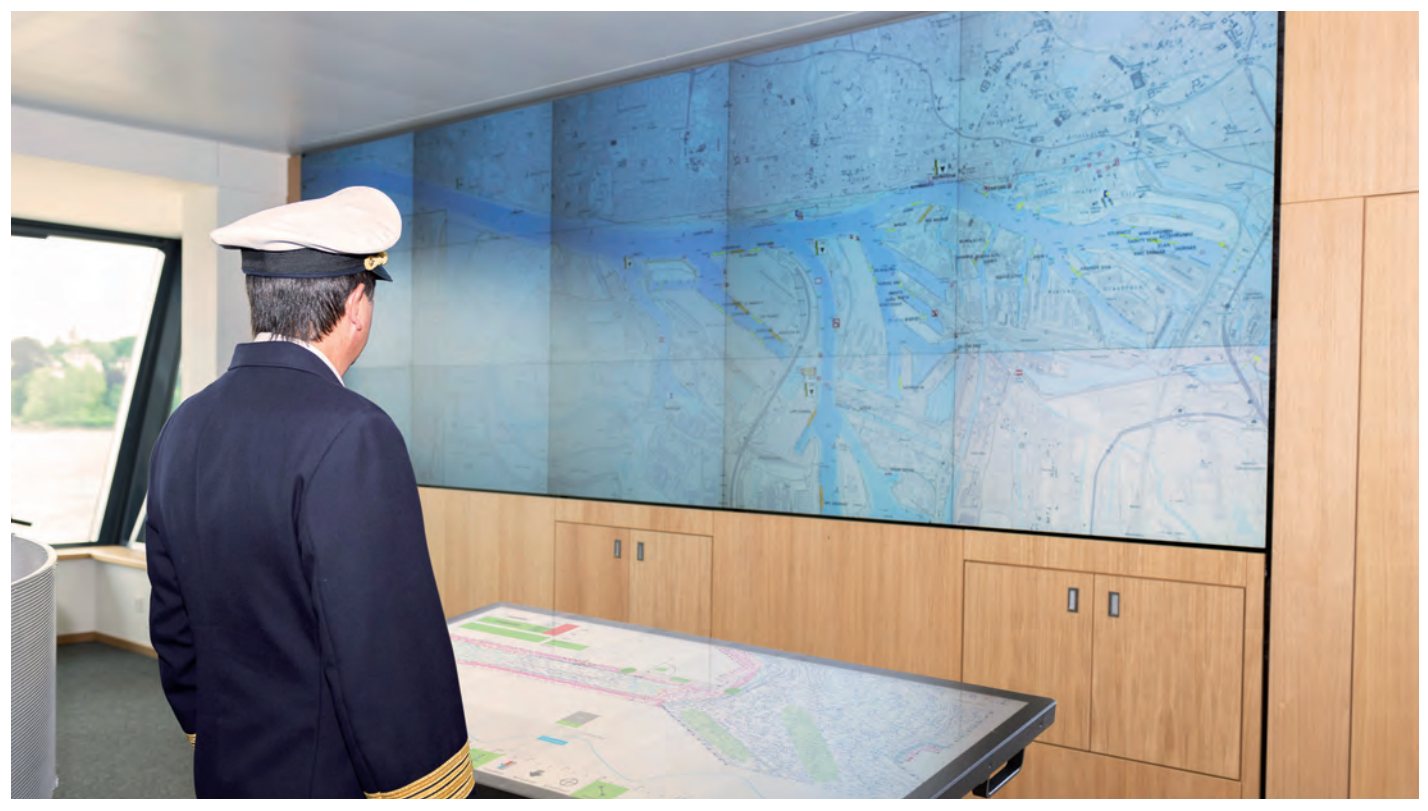
▲ Figure 3: The hydrographic chart table in front of the video wall at the Nautical Centre.

management mainly uses profiles to assess the state and required maintenance of the river banks.